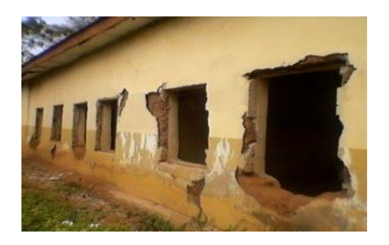
Fig. 3. Damaged classroom windows, not repaired but still in use.