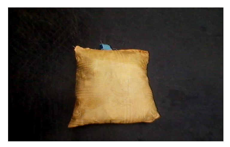
Fig. 4(a) Improvised duster produced by students for use in many classrooms in Nigeria in the 21<sup>st</sup> Century.