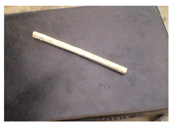
Fig. 4(b) Police Baton ( Kondo Olopa ) improvised by Police Cadets in a Nigeria Police College.