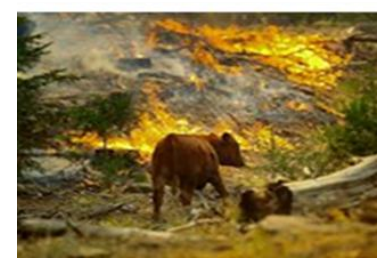
Figure 7: Bush burning and a stranded cow

A cross national study was carried out among academic staff of universities in anglophone West Africa on their climate change and sustainable development knowledge, attitude and practices. Six universities were