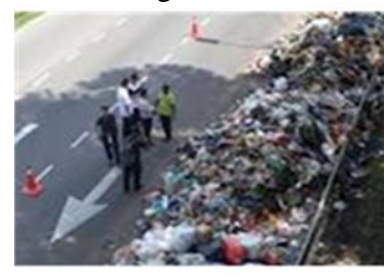
Figure 5: Roadside refuse dump

With the probability that some graduates of junior high schools may not proceed to the senior high or even higher education, the likelihood that those ones who end with basic education would be able to reasonably analyse and solve problems related to climate change and sustainable development is negligible. The value for acquiring skills of handling natural and man-made conditions occasioning changes in the climate through the basic school system in Ghana was here investigated. Again, the verdict is low and Figures 5, 6 and 7 show the ways human beings contribute to environmental degradation: