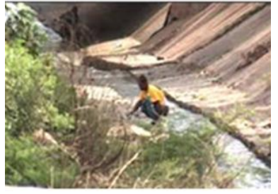
Figure 6: Defecating into the stream