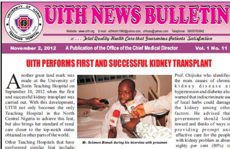
Fig 4 : Reportage of UITH's first kidney transplant

constitutes up to 10% of total hospital admissions and 90% of the patients die within 3 months. Hitherto, haemodialysis was the best treatment offered in UITH, but this is expensive on the long run costing about N70, 000 per week for life. Hence, my Administration re-activated UITH plans to commence kidney transplant and became the fourth public health institution in Nigeria to successfully carry out a renal transplant in Nigeria in September 2012. By this courageous feat, hope was restored to a previously 'helpless' 29-year-old young man and, by so doing UITH broadened its scope of clinical service delivery and academic excellence.