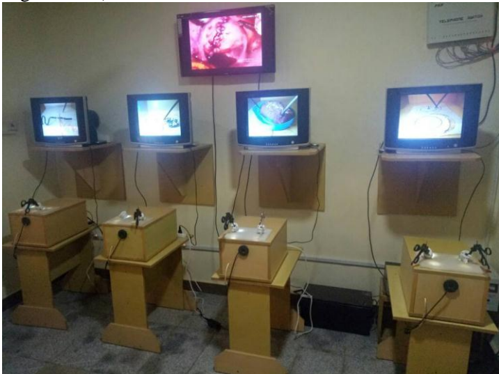
Fig 7: The Endo-Trainer Laboratory

In order to expand the practice of these procedures in our locality, training and re-orientation of postgraduate medical doctors and surgeons in laparoscopic techniques become imperative. However, sophisticated, conventional virtual reality trainer-systems are prohibitively expensive and unaffordable in a low-resource setting like ours. In our centre, we therefore designed our own endo-trainer using locally available and affordable materials and this has helped to sustain the culture of this sophisticated surgical method in our hospital. The cost of production our own innovation is about $750(N270, 000), while virtual reality system costs $8,500(N3 million) each. The results of training on both have been shown to be similar and comparable. The endo-trainer as shown underneath has been presented with very warm reception at local and international conferences. (Omokanye, Saidu, Olatinwo , Salaudeen, &, Balogun. 2013)