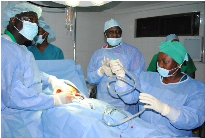
Fig 2: The Inaugural Lecturer (centre) in the operating theatre about to take delivery of an IVF baby