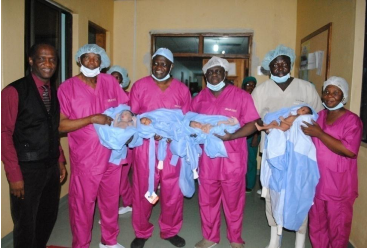
Fig 3: The Inaugural lecturer (3 rd from left) and other surgeons after delivery of a set of IVF babies