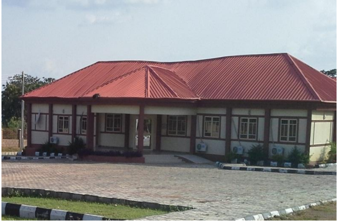
Fig 1: The New ART/IVF Building