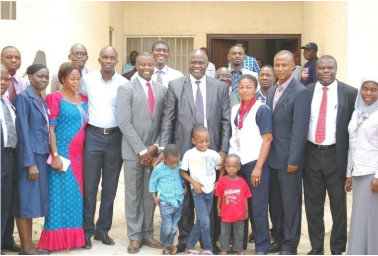
Fig 6 : The Inaugural lecturer , with other members of UITH Top Management Committee and members of the UITH Care Team with the 3 children (standing in front) beneficiaries of the Open Heart Surgery programme after they were discharged from the hospital